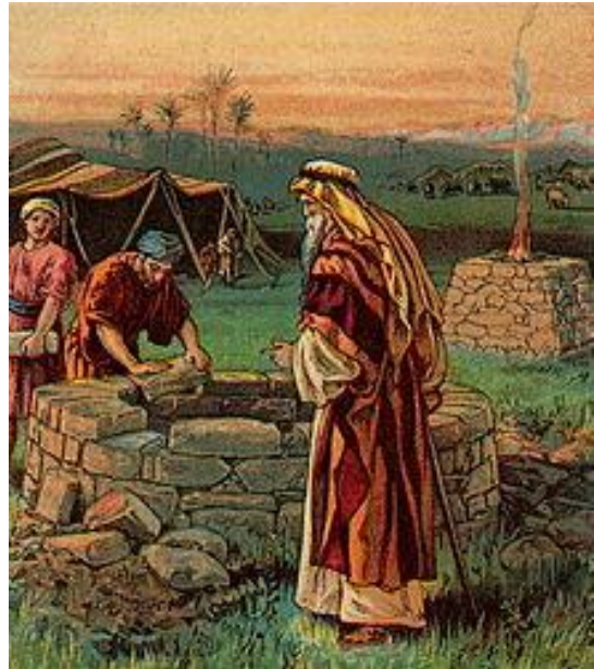
Isaac digging for the wells, imagined in a Bible illustration (c. 1900)

Although Yitzchak may have suffered significant trauma through this ' near death experience ', we see that he is a man of character who continues to press on, carrying on his father's business of re-digging the wells his father had dug on his way to Beer Sheva.