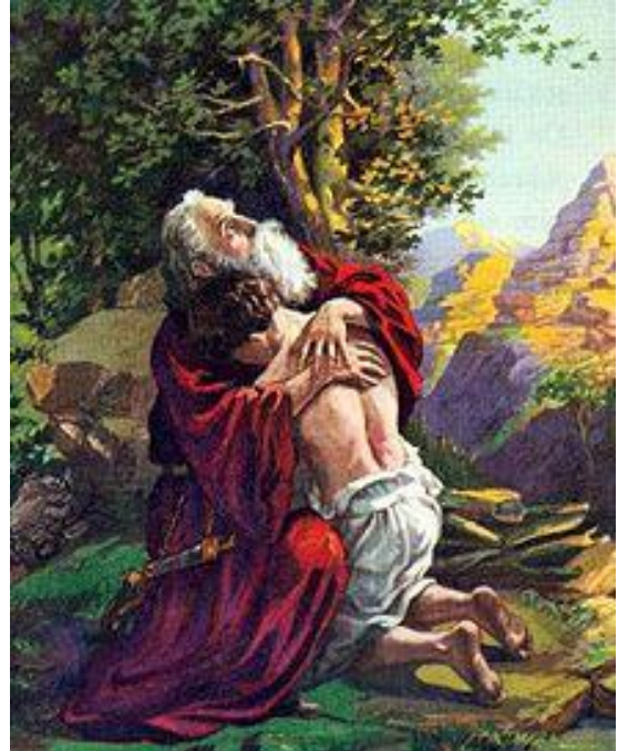
Isaac embraces his father Abraham after the Binding of Isaac , early 1900s Bible illustration

With the inclusion of the supernatural power of God in Abram's life, he finally succeeded in seeing the fulfillment of God's promise of a son. So, too, are we in our limited human abilities able to do nothing of eternal value 2 ; but when God gets involved – nothing is impossible!!