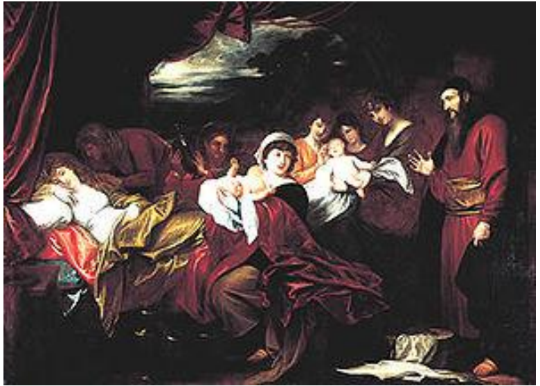
The birth of Esau and Jacob, as painted by Benjamin West

The struggle between the two boys in Rikvah's womb foreshadowed an intense sibling rivalry between Jacob and Esau that still carries on today between their descendants. Today the descendants of the carnal, war-like, son of Isaac, Esau, continue with their 'ancient hatred' towards the descendants of Jacob (Israel).