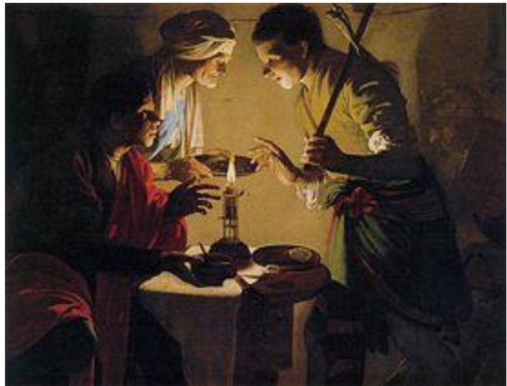
Esau Selling His Birthright (painting circa 1627 by Hendrick ter Brugghen)

I notice something interesting here in the choice of the Hebrew wording used in this Scripture. The word used for ‘ despised ’ is וַיְבִז (va’yibez) . It does not so much mean ‘despise’ (as in hate) but is rather related to the concept of ‘ waste or squander ’ (bizbez).