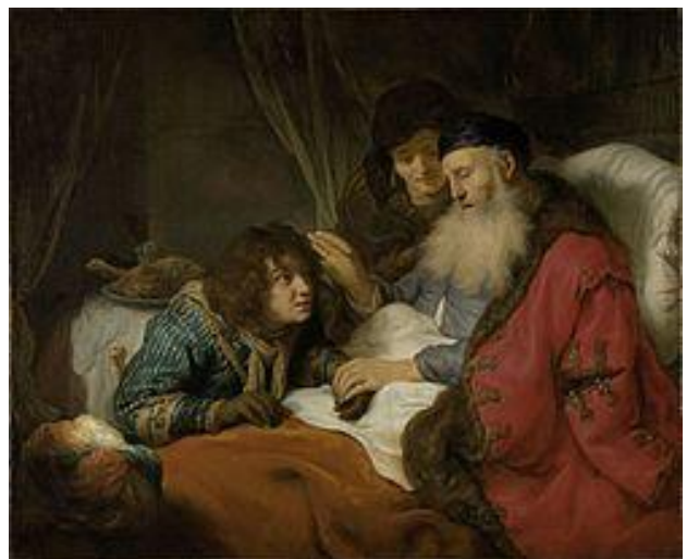
Grave Isha – Isaac blessing his son Jacob

Isaac, being old and almost blind, intended to give his blessing to his favorite son, Esav, but instead, he inadvertently bestowed the blessing upon Jacob, who pretended to be his brother.