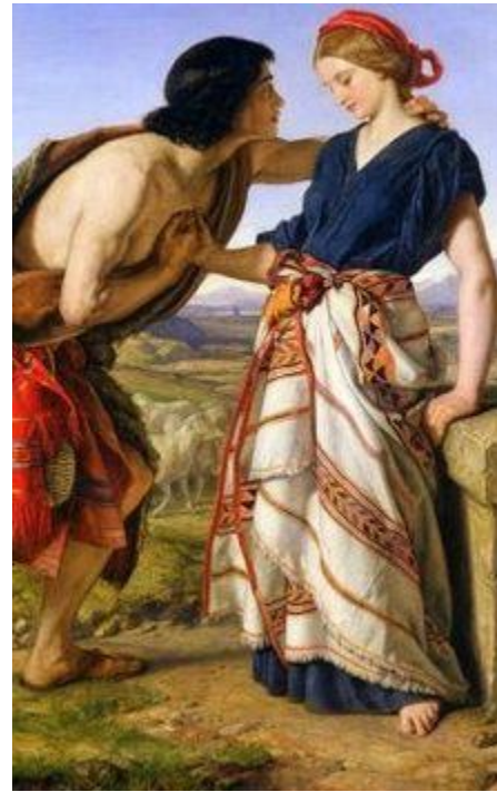
Rachel and Jacob by William Dyce

Rather than giving him Rachel, Laban tricks him by giving him her less attractive sister, Leah, whom Jacob did not love. This is why a Jewish wedding also begins with the custom of ' bidikut kalah ' – checking the bride. The groom, escorted by all the men and accompanied by singing and dancing, enters the chamber of the women. Here sits the bride and all her attendants, female friends and relatives. At this point, the groom checks that he's really getting the woman he chose. It is a beautiful ceremony, confirming the groom's choice of this particular bride and no other.